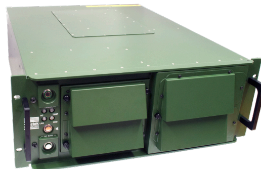
Optional louvre front for IP53

Over 30 years' experience designing and manufacturing high quality, rugged, mission critical IT solutions for use in extreme environments